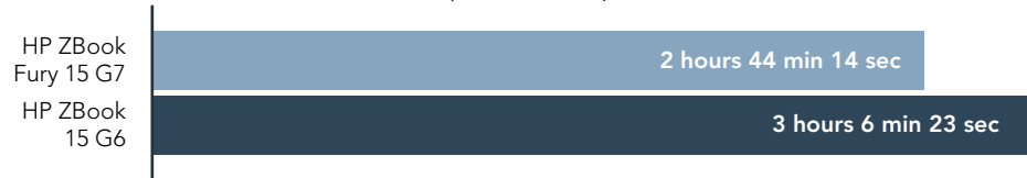
Figure 5: Autodesk Revit best (printer) quality rendering time comparison for the HP ZBook 15 G6 vs. HP ZBook Fury 15 G7. Lower is better.