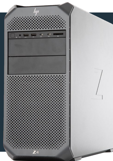
Figure 3: The HP Z4 workstation.