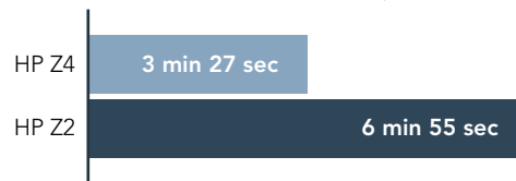
Figure 1: Autodesk Fusion 360 rendering time comparison for the HP Z2 vs. HP Z4 workstation. Lower is better.