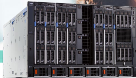
Dell EMC™ PowerEdge™ MX platform powered by Intel® Xeon® Scalable processors